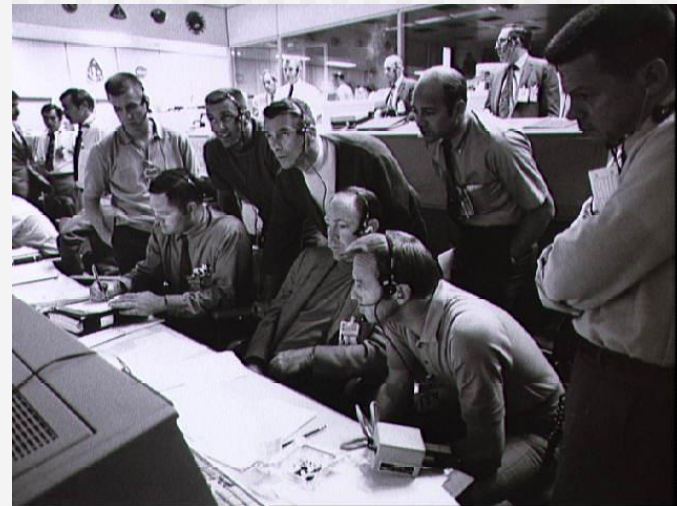
Apollo 13 CO2 Problem

What are some things I can do with this quarter (other than spend it)?