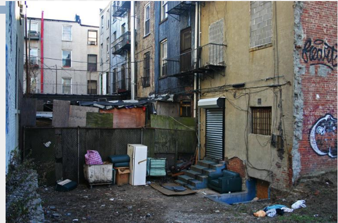
The Bronx, NY

Which place would you be more scared of getting mugged or even murdered?