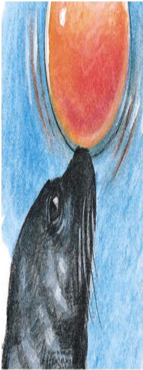
(a) Response: balancing a ball