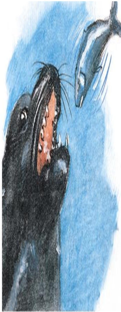
(b) Consequence: receiving food