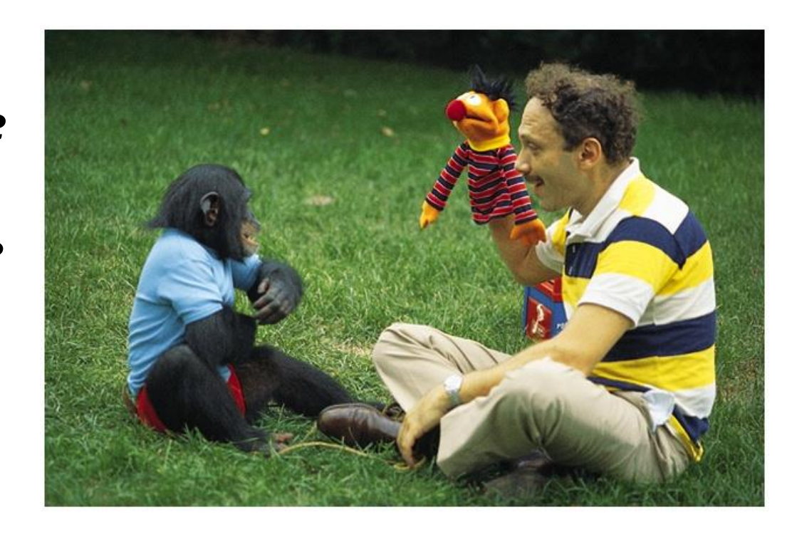
Is language uniquely human?

Psychologists study one or more individuals in great depth in the hope of revealing things true of us all